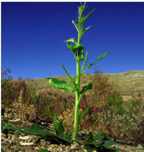
Fig. 1: Manduca sexta larvae (tobacco hornworm) feeding on the wild annual tobacco Nicotiana attenuata in the Great Basin Desert, Utah, USA.