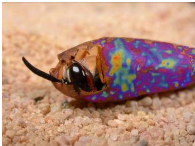
Figure: The beewolf larva hibernates for several months in its cocoon before the adult insect hatches. Antibiotics on the surface of the cocoon, produced by symbionts, guarantee protection against microbial pests during such long developmental stage. The amount of antibiotics was visualized by means of imaging techniques based on mass spectrometry (LDI imaging) and merged as pseudocolors onto the cocoon.

Digger wasps of the genus Philanthus , so-called beewolves, house beneficial bacteria on their cocoons that guarantee protection against harmful microorganisms. Scientists of the Max Planck Institute for Chemical Ecology in Jena teamed up with researchers at the University of Regensburg and the Jena Leibniz Institute for Natural Product Research – Hans-Knoell-Institute - and discovered that bacteria of the genus Streptomyces produce a cocktail of nine different antibiotics and thereby fend off invading pathogens. Using imaging techniques based on mass spectrometry, the antibiotics could be displayed in vivo on the cocoon's exterior surface. Moreover, it was shown that the use of different kinds of antibiotics provides an effective protection against infection with a multitude of different pathogenic microorganisms. Thus, for millions of years beewolves have been taking advantage of a principle that is known as combination prophylaxis in human medicine. (Nature Chemical Biology, Advanced online publication, February 28, 2010)