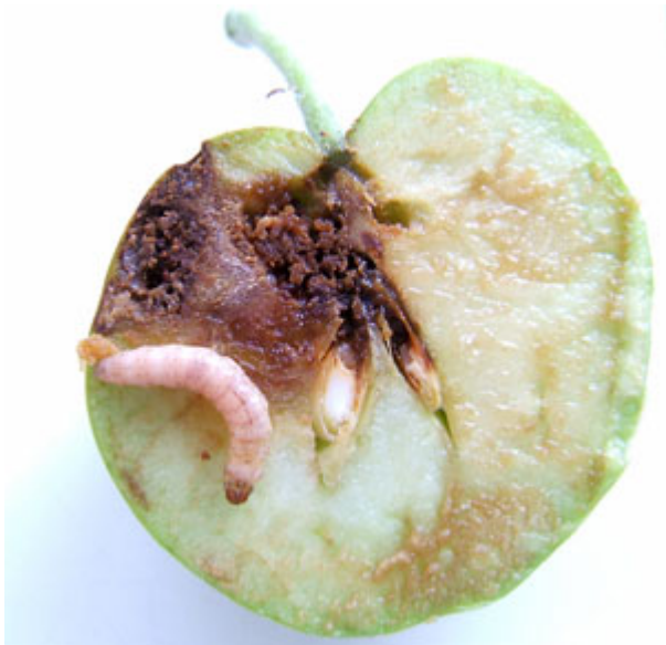
Fig. 1: A feared pest of orchardists: the codling moth caterpillar.